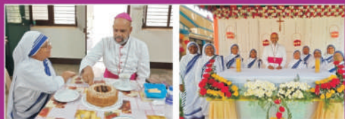
Feast of St. Mother Theresa - Bishop's Visit (September 5)