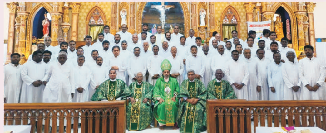
Annual Clergy Retreat - Velankanni