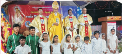
Feast Day Celebration - Thevur