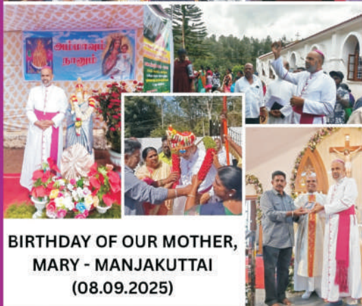
BIRTHDAY OF OUR MOTHER, MARY - MANJAKUTTAI (08.09.2025)